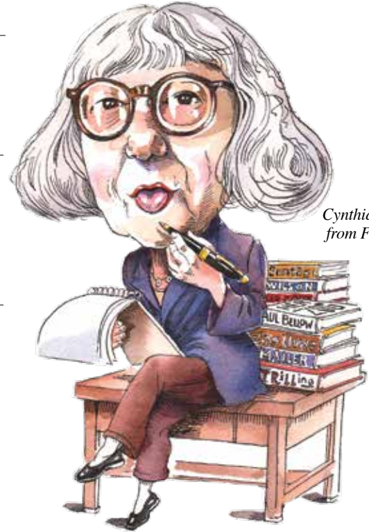
Cynthia Ozick from Fall 2016

Available for print advertisers only: $500 for the ad to automatically pop-up within the app. The ad can feature any content of your choice (e.g., audio, video, slideshow).