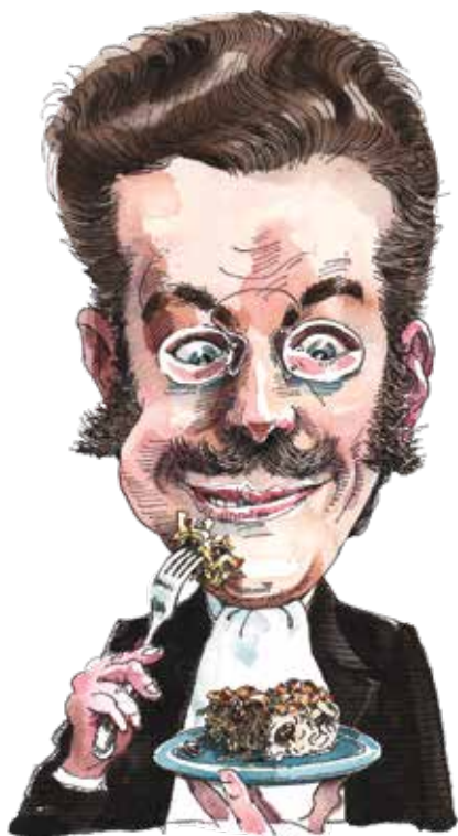
Franz Rosenzweig from Winter 2014