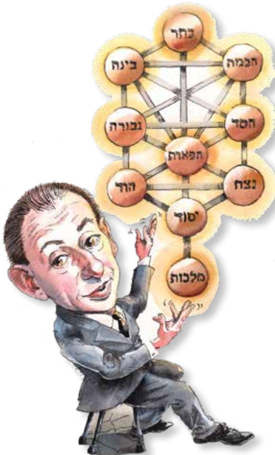
Gershom Scholem from Fall 2018