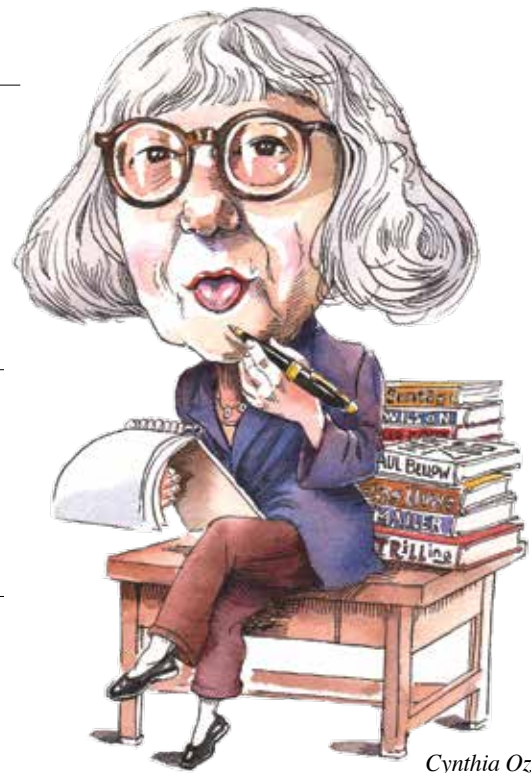
Cynthia Ozick from Fall 2016

Note: Dedicated email blast dates are limited; Please book well in advance.