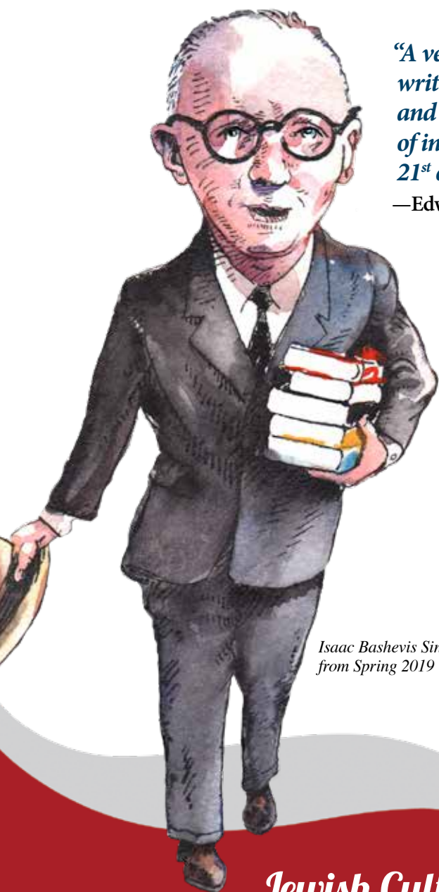
Isaac Bashevis Singer from Spring 2019