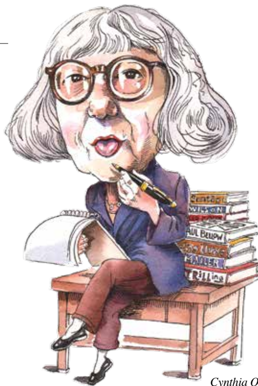
Cynthia Ozick from Fall 2016

Note: Dedicated email blast dates are limited; please book well in advance.