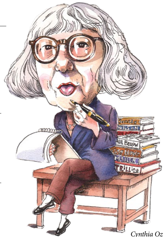
Cynthia Ozick from Fall 2016

Note: Dedicated email blast dates are limited; please book well in advance.