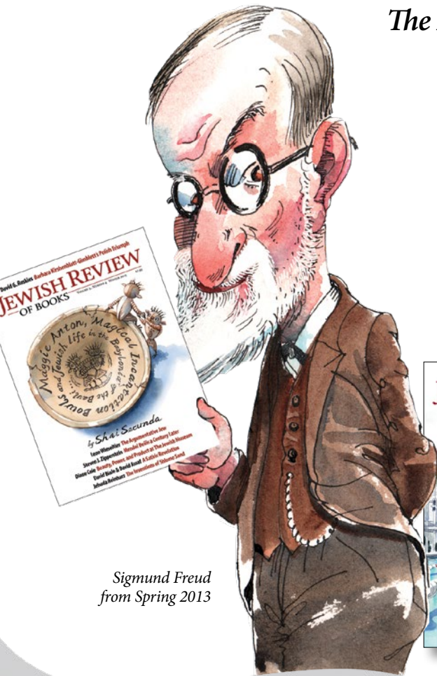
Sigmund Freud from Spring 2013