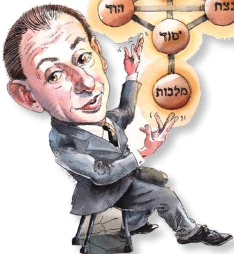
Gershom Scholem from Fall 2018